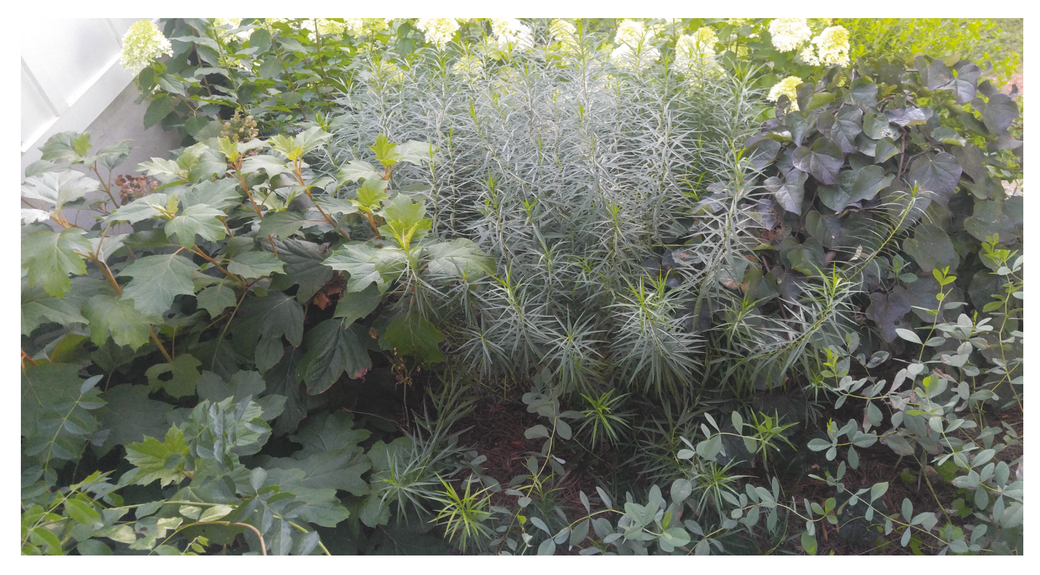
Figure 2 , Plant Diversity. Use a diversity of plants to create unique visual appeal, ward off large scale loss from disease or pests, and provide a variety of benefits for wildlife. Here, native oakleaf hydrangea, needle-leaved bluestar amsonia and false indigo are paired with an Eastern Redbud variety selected for contrasting foliage colors.

in developed land in Tennessee. Currently, over 3 million acres are dappled with buildings, roads and parking lots (TACIR 2011). With Tennessee population expected to reach nearly 7.4 million by 2030 (CBER), land development will certainly continue at a fast pace into the future decade.