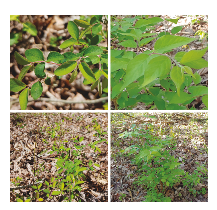
Figure 3. Removing invasive non-native species helps the native vegetation flourish, but sometimes non-native invasive plants and have native lookalikes. Coralberry (Left) is a Tennessee-native shrub that is easily identified in the winter when it has bright pink drupels of berries, but in early spring, can look like invasive, non-native bush honeysuckles (Right). Read about other look-alikes in the "Mistaken Identity" publication.

healthy soils and plants, which will act as a buffer for streams and aquatic habitats all while creating new opportunities for unique plants in your outdoor space.