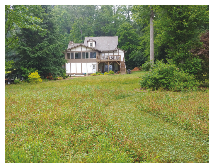
Figure 5 , Mowpath. Choosing narrow mown paths to connect spaces allows for more lush vegetation in the surrounding untrafficed areas and less time devoted to mowing.