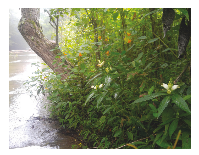
Figure 4, Riparianbuffer. A walkway through lush vegetation along a creekside (called a riparian buffer) allows for easy viewing of the creek and these white turtlehead and orange jewelweed. These plants, along with the canopy maples, provide shade to the stream and help reduce the risk of stream bank erosion.